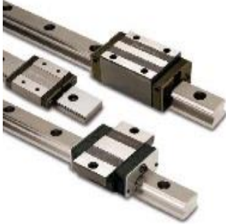
Linner Kızak Sistemi